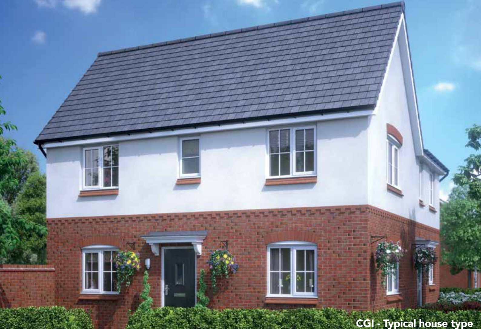
CGI - Typical house type